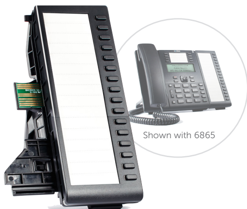
M680 Expansion Module