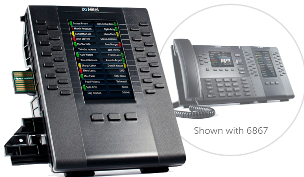
M685 Expansion Module